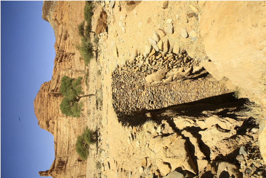
Old wells in Mabu mountain