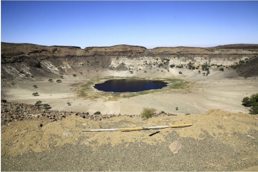
Ancient spring of Malha