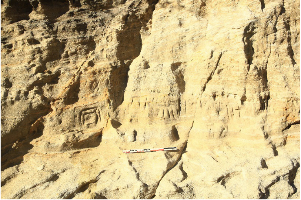
Rock art in Abu Nashab