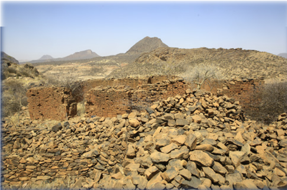
The mosque in Ayn Farah