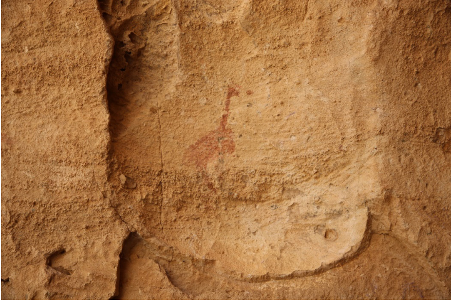
Rock painting in King Namdo cave