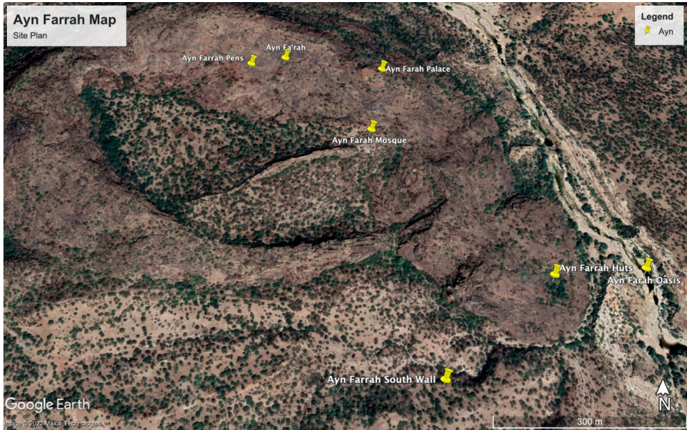
Distribution of sites in Ayn Farrah