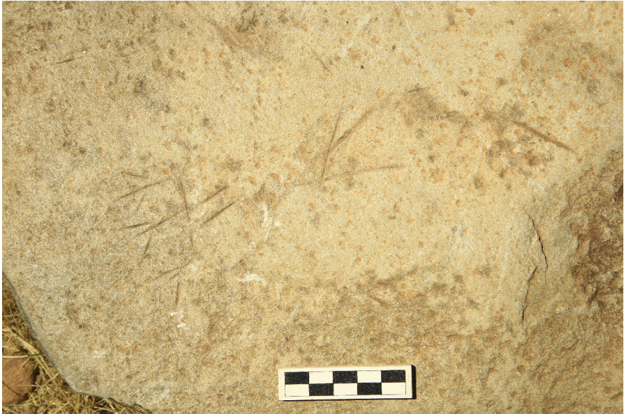
Graffiti in Aumu village